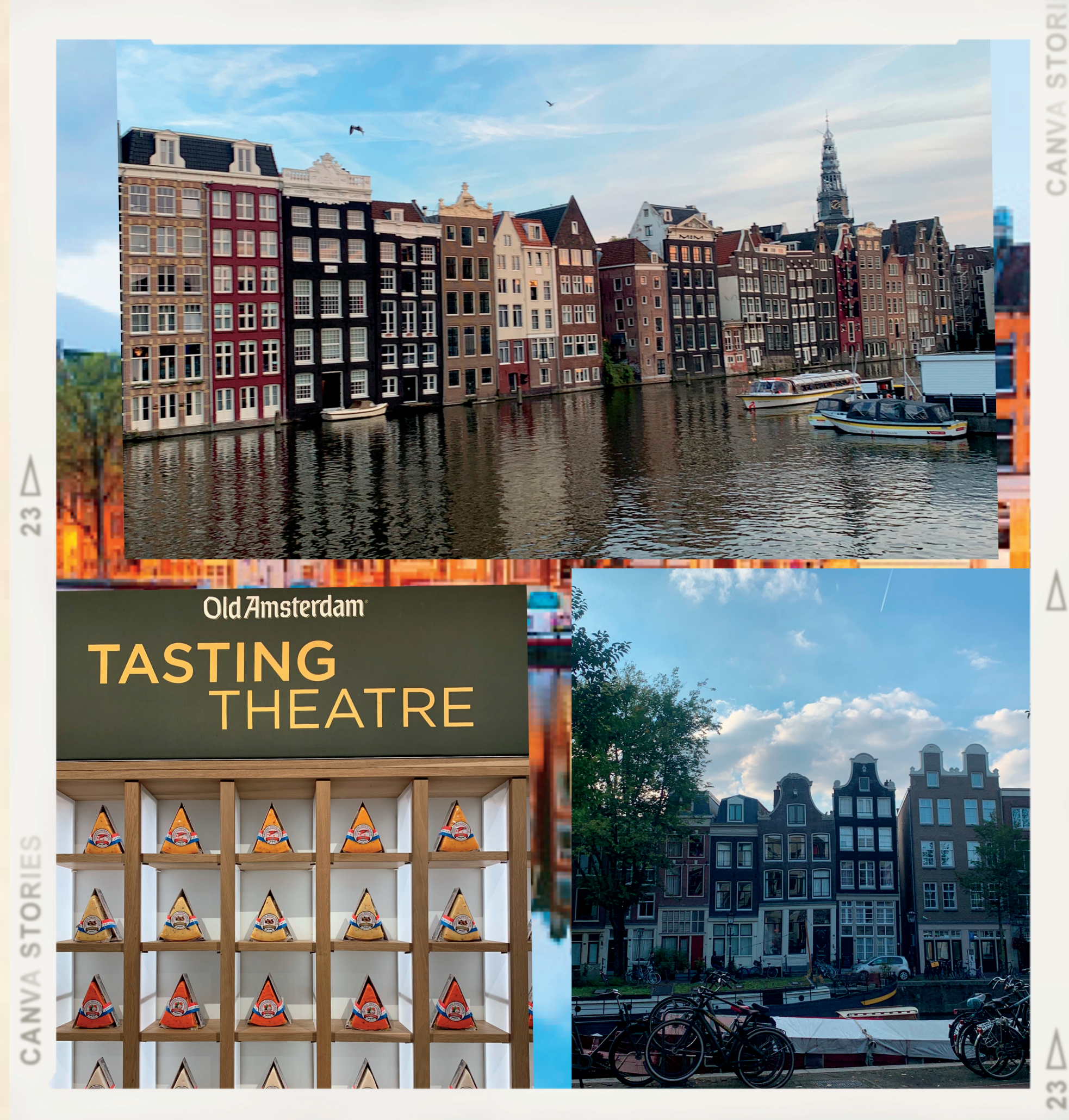
Picturesque Amsterdam – a museum lover’s paradise