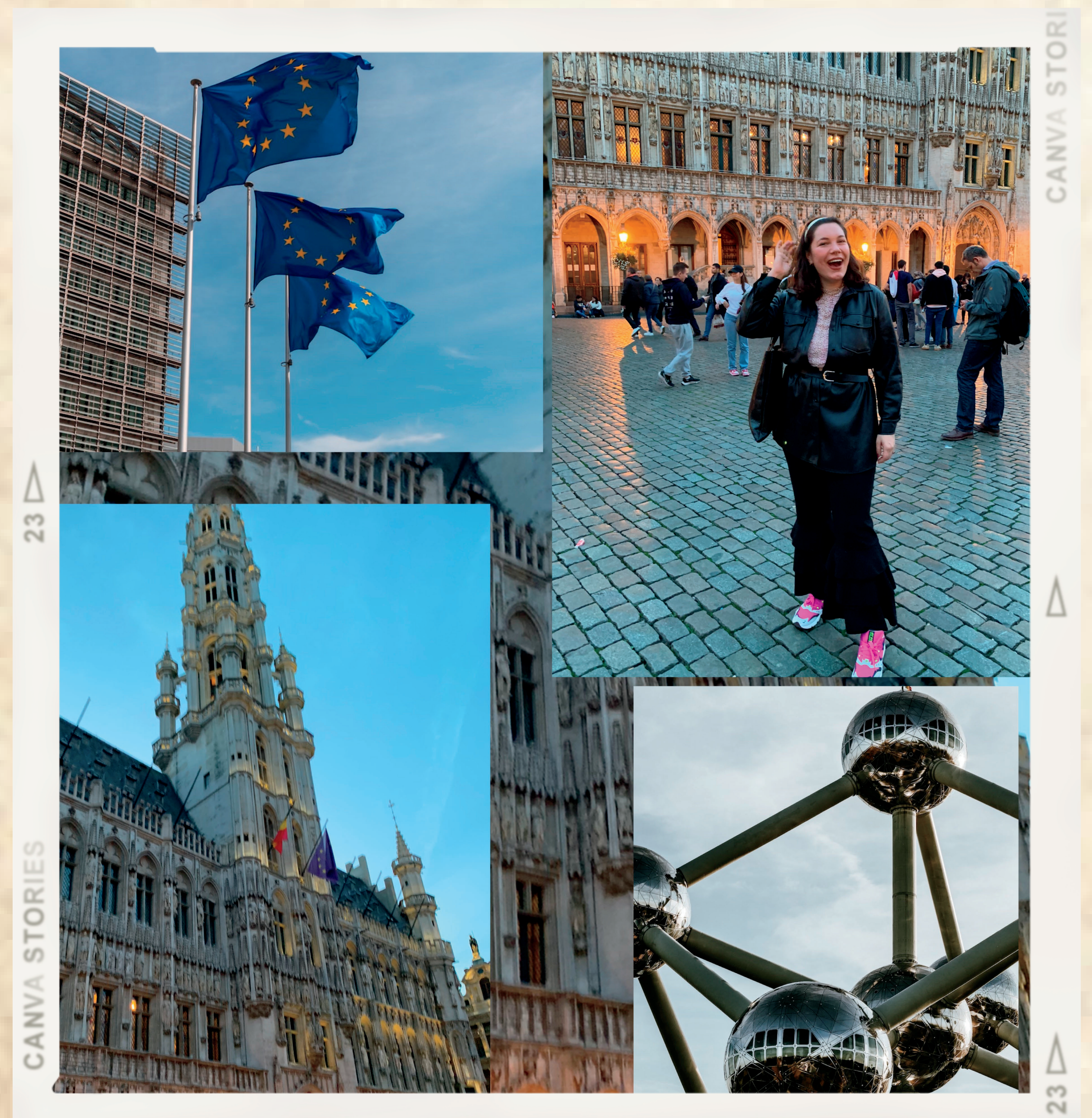
Brussels, the European capital and its dual function within heritage promotion