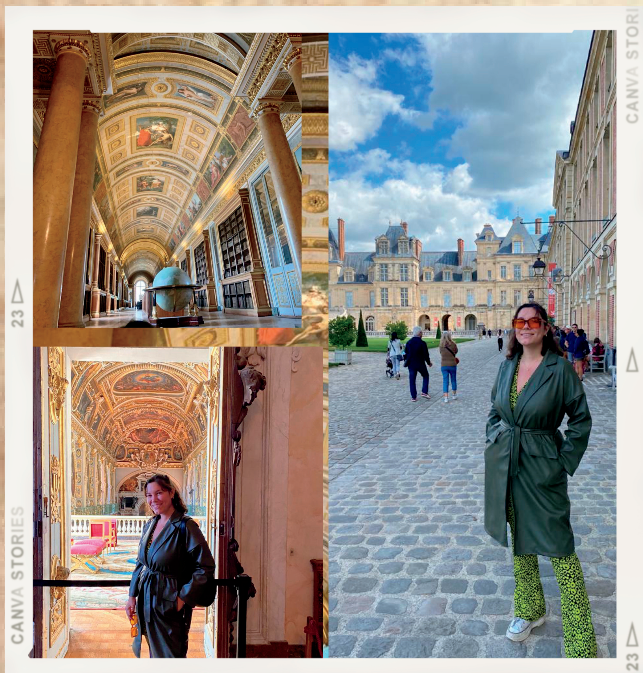
Fontainebleau, the hidden gem