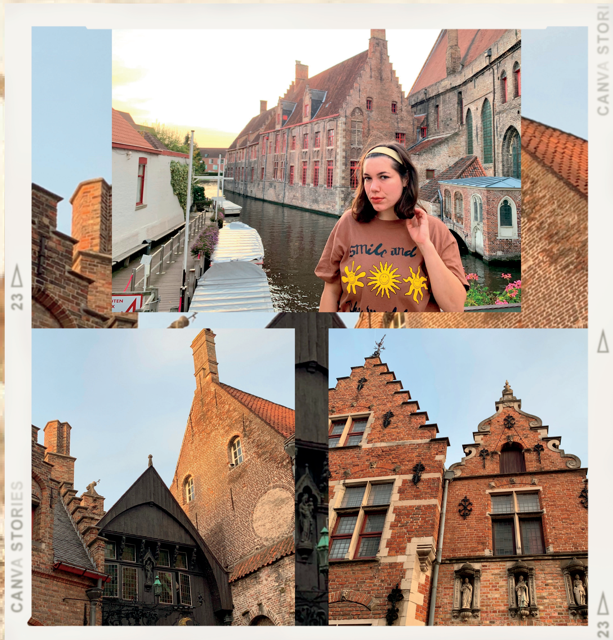
Brügge, the medieval fairy tale